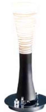
DENE B 2481 P47 BM Dimensioni : H 30 Ø 13 Watt: 1XG9 60W MAX