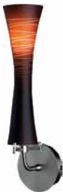
DENE B 2481 A47 TM Dimensioni : H 35 Ø 10 Watt: 1XG9 60W MAX