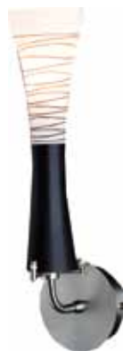
DENE B 2481 A47 BM Dimensioni : H 35 Ø 10 Watt: 1XG9 60W MAX