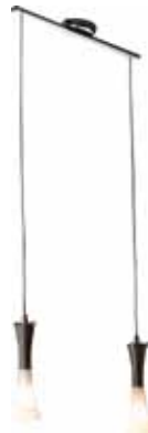
DENE B 2482 47REG BM Dimensioni : H 27 + REG L 50 Watt: 2XG9 60W MAX