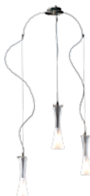
DENEb 2483 47 SAT Dimensioni : H 27 + REG ∅ 50 Watt: 3xG9 75W MAX