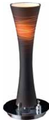
DENE B 2481 P47 TM Dimensioni : H 30 Ø 13 Watt: 1XG9 60W MAX