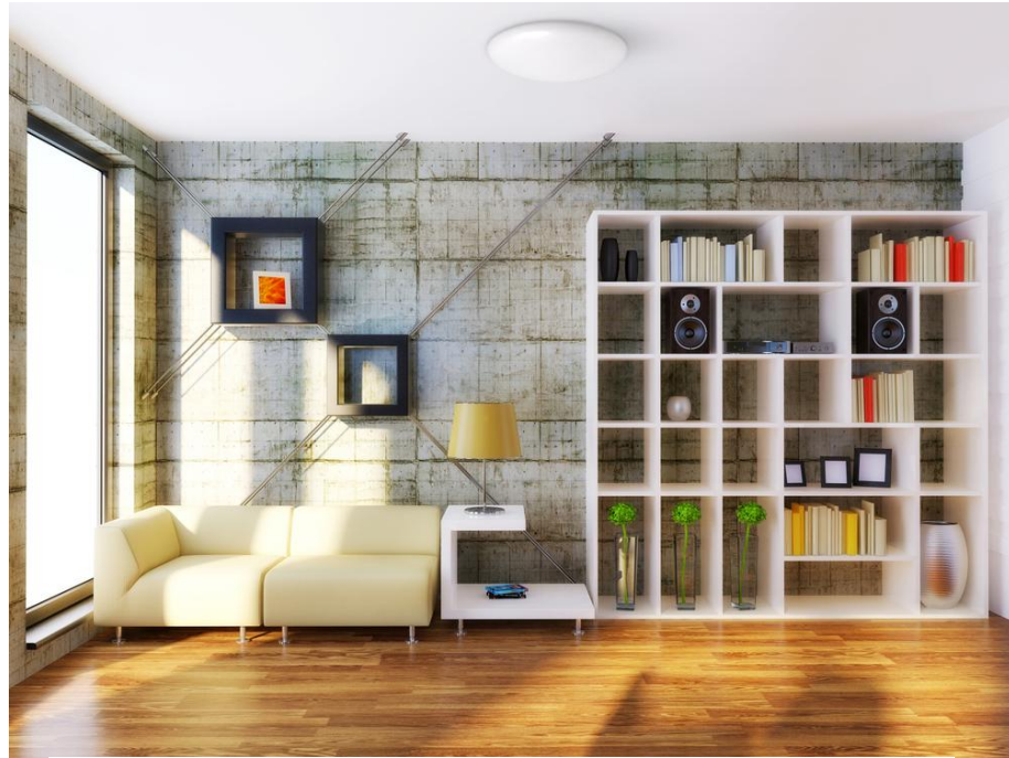
Circular Low Profile Range