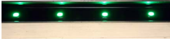
SINGLE COLOUR WASHING OR HIGHLIGHTING