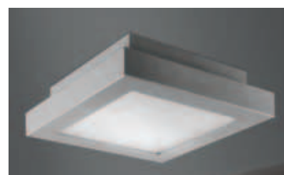
3035 EL - 3036 EL - 3037