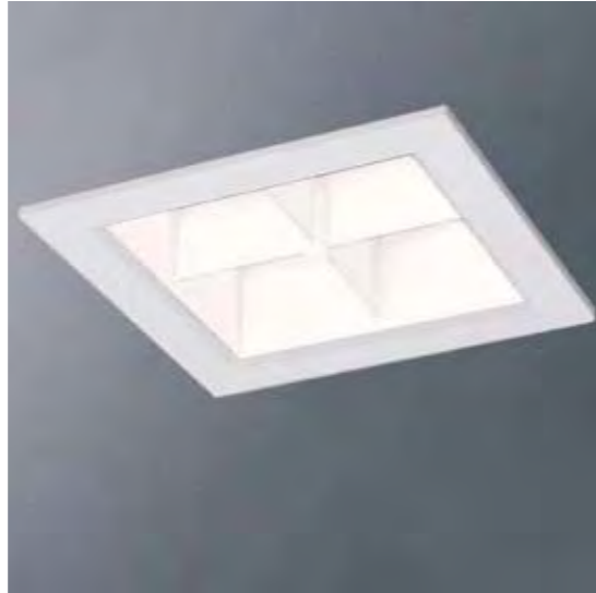
DOWNLIGHT SQUARE WHITE CROSS LOUVRE