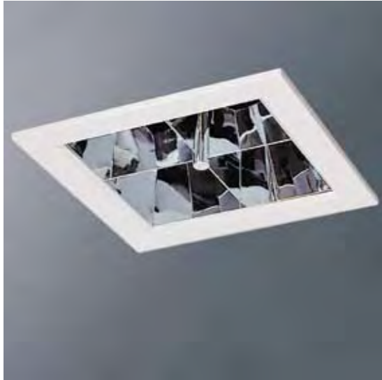
DOWNLIGHT SQUARE SILVER CROSS LOUVRE